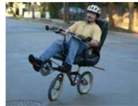
Office Chair Bike