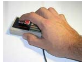
NES Gamepad Mouse