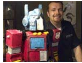
Optimus Prime Cake