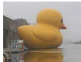
Giant Rubber Duckie