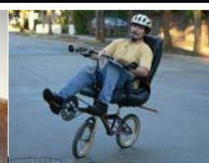
2 Office Chair Bike