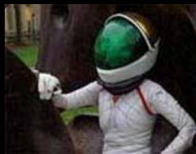
3 New Spacesuit