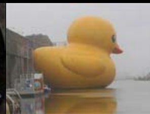
4 Giant Rubber Duckie