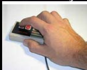
1 NES Gamepad Mouse