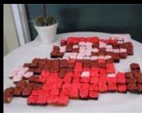
5 Pixel Mario Cake